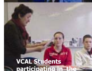
VCAL Students participating in the "perfect day" community project ...more inside>>